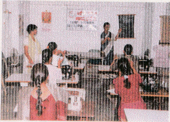
TRAINING & TAILORING

Deaf Women Development Trust (DWDT) in 2000, as Registered Trust, to help Deaf Women in Society especially the economically weaker section to lead a better life. DWDT has dedicated and reputed persons from all walks of life including social workers, counselors, volunteers, trainers and speakers working toward the welfare of women with hearing impairment.