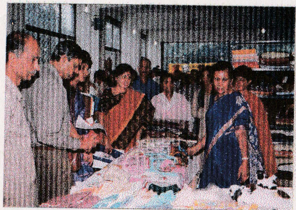
SAFIA PLAZA EXHIBITION

1987, I started my own business hop (Gowroo Fashion Designers) in manufacture of readymade garments by training and employing speech and hearing impaired women. In recognition of her outstanding performance dedication and my concern to help disabled women to be trained in tailoring at free of cost and also provided them suitable employment in my organisation. Now 25 deaf women are trained for tailors and now they are improving well. In recognition of my outstanding performance. I was conferred national award on 3 rd December 1995, for outstanding disabled, self-employed entrepreneur by President of India, Shri Shankar Dayal Sharma and on 3 rd December 2000, I have received a prestigious state award from Governor Her Excellency Smt. V.S.Rama Devi.