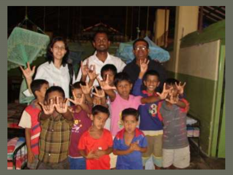
Children now enthusiastic about education