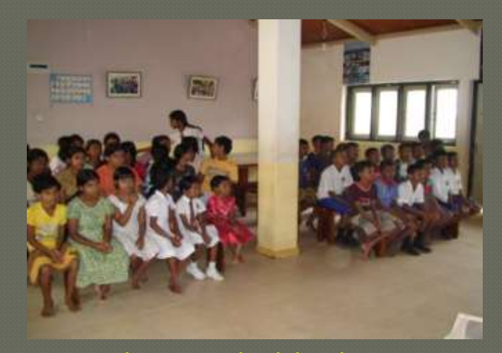
students watched the drama