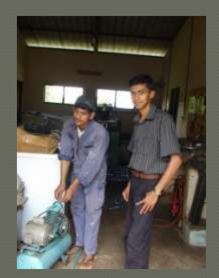
Boss with Deaf employee