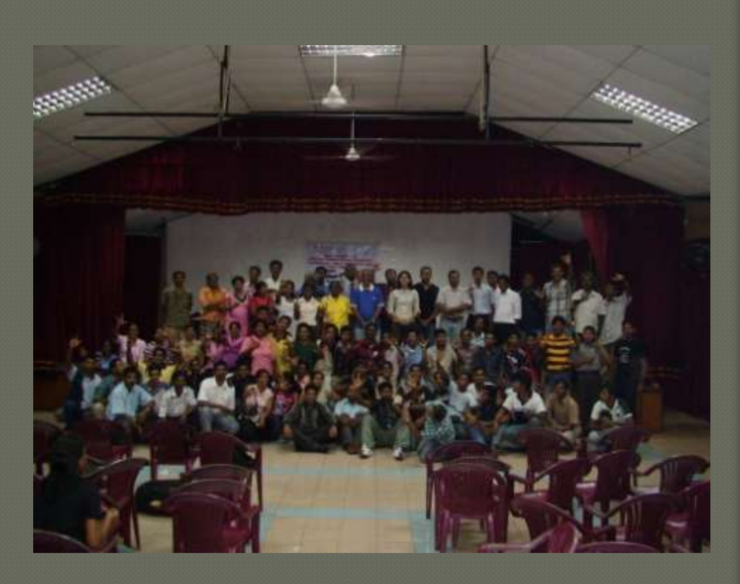
Participants in Sri Lanka