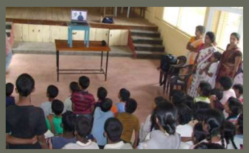
Students watching the video