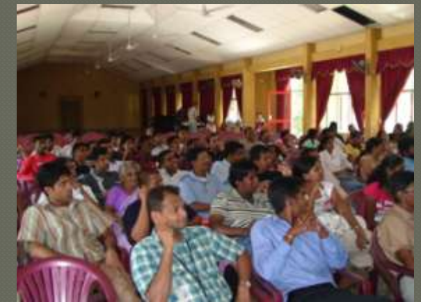
Deaf peoples are convinced on the need to think positive