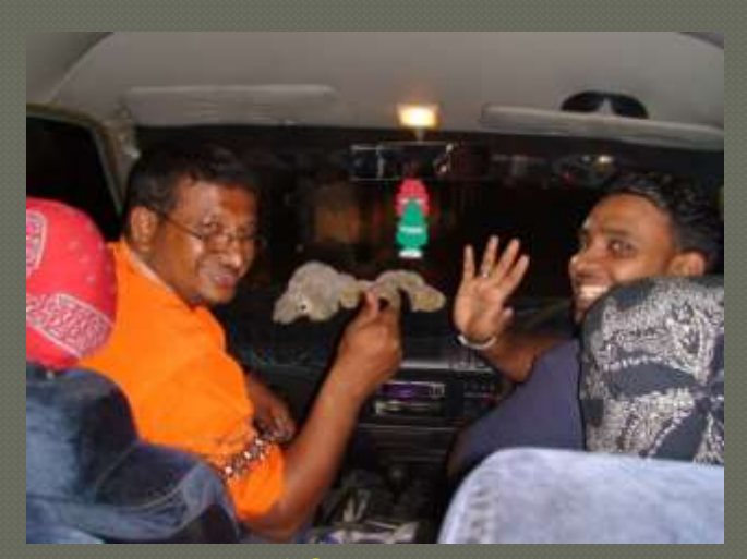
Deaf Cater Business