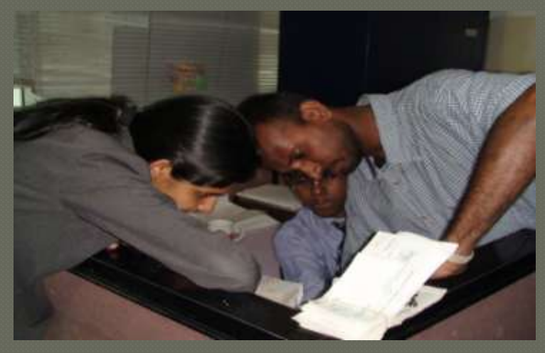
Good Communication with Staffs