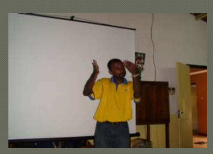
Teach to students