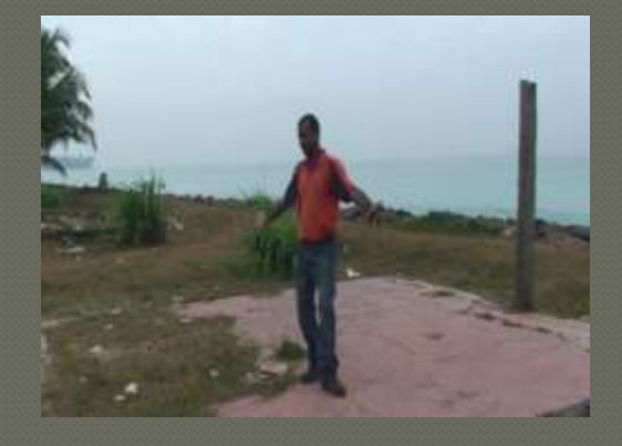
A destroyed the house