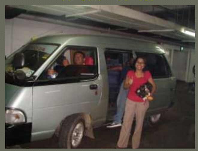
A Deaf owner splendid car