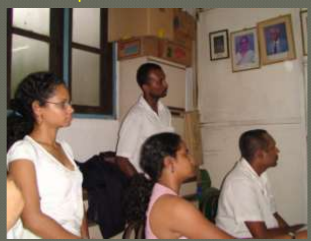
Volunteers wishing to join PPA members