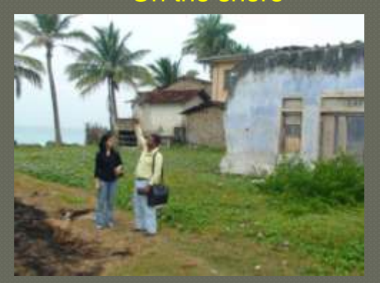
Height on Waves