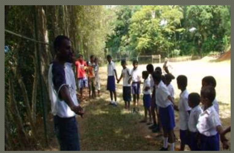
Warm up exercises