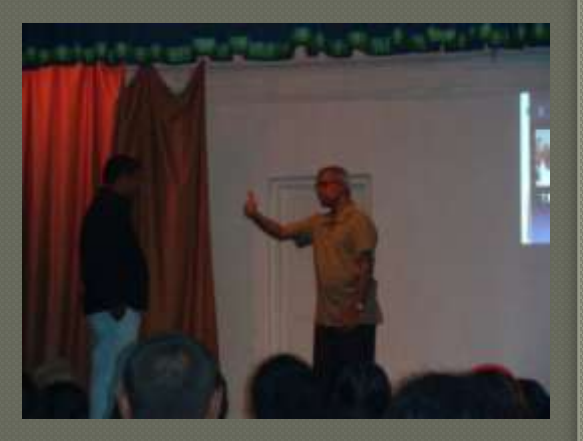
Feedback from Sri Lankans Was encouraging