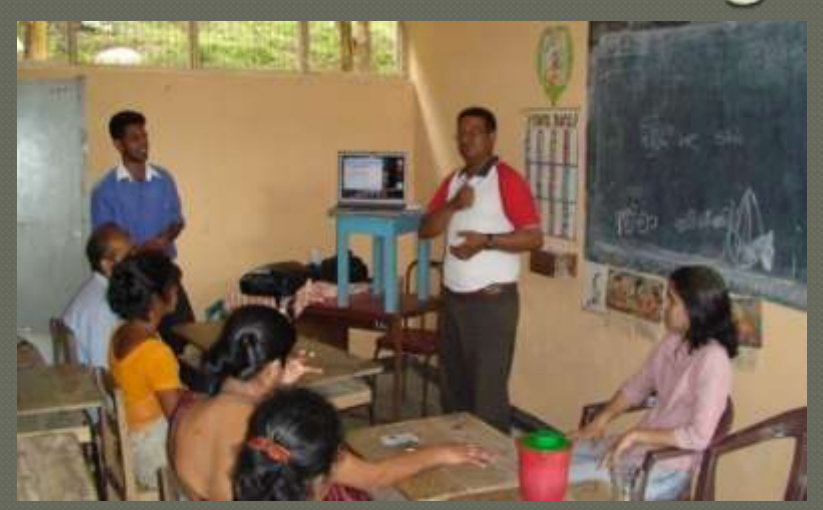
Importance to attitudes of the students