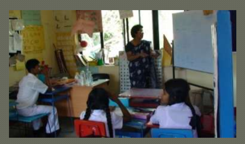
A class in progress