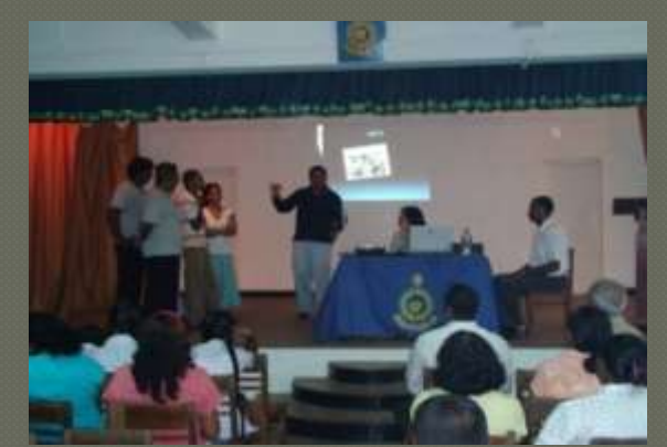
Government benefits for Deaf: Drama Highlighted the importance of unity among the deaf