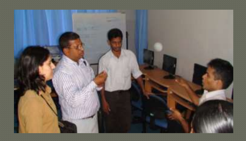
Deaf Computer Teacher