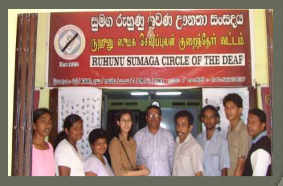
Deaf people at Centre