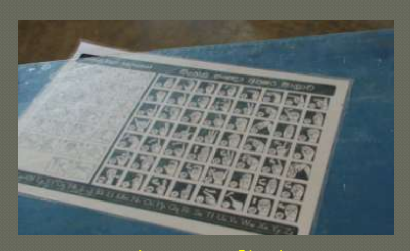
A poster on Sign Language