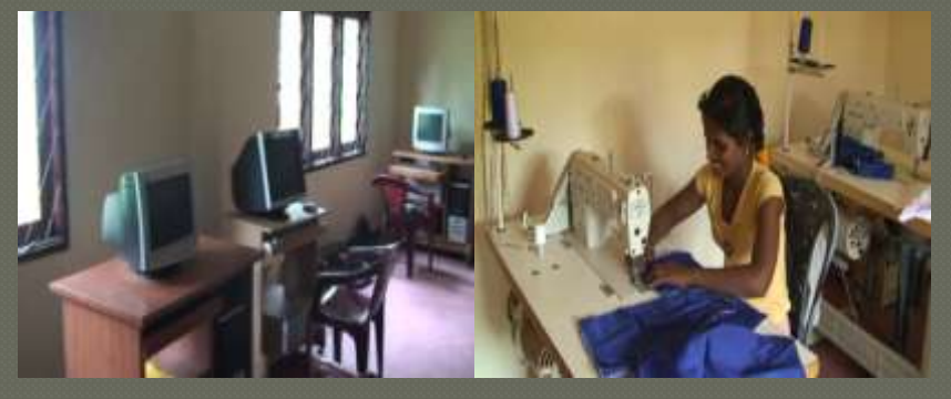
Vocational Training on Tailoring & Computers