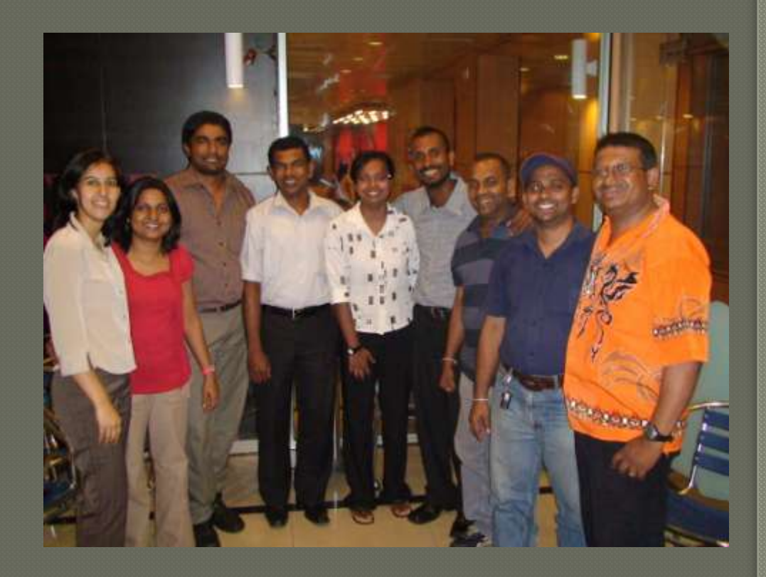
Youth Deaf community