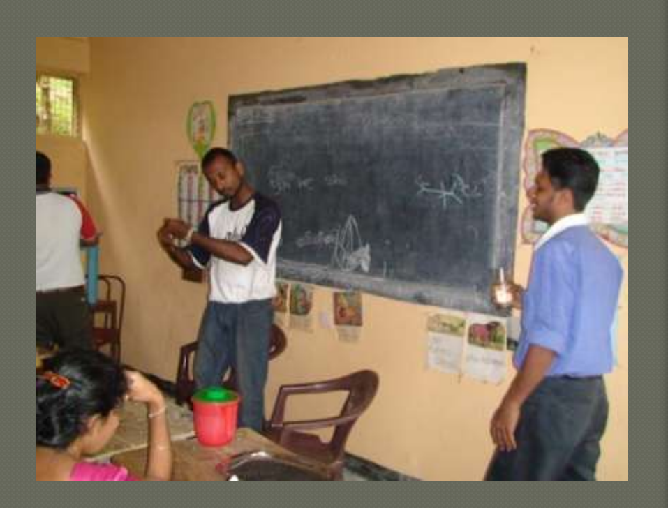
Teachers need to focus on improvement of educations