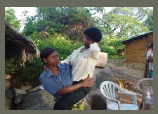
Mother and child