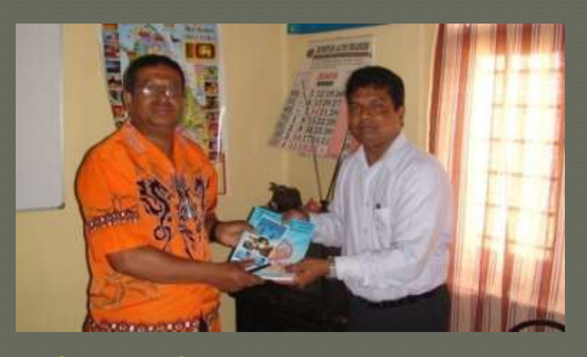
Sri Lanka Sign Language Directory to India