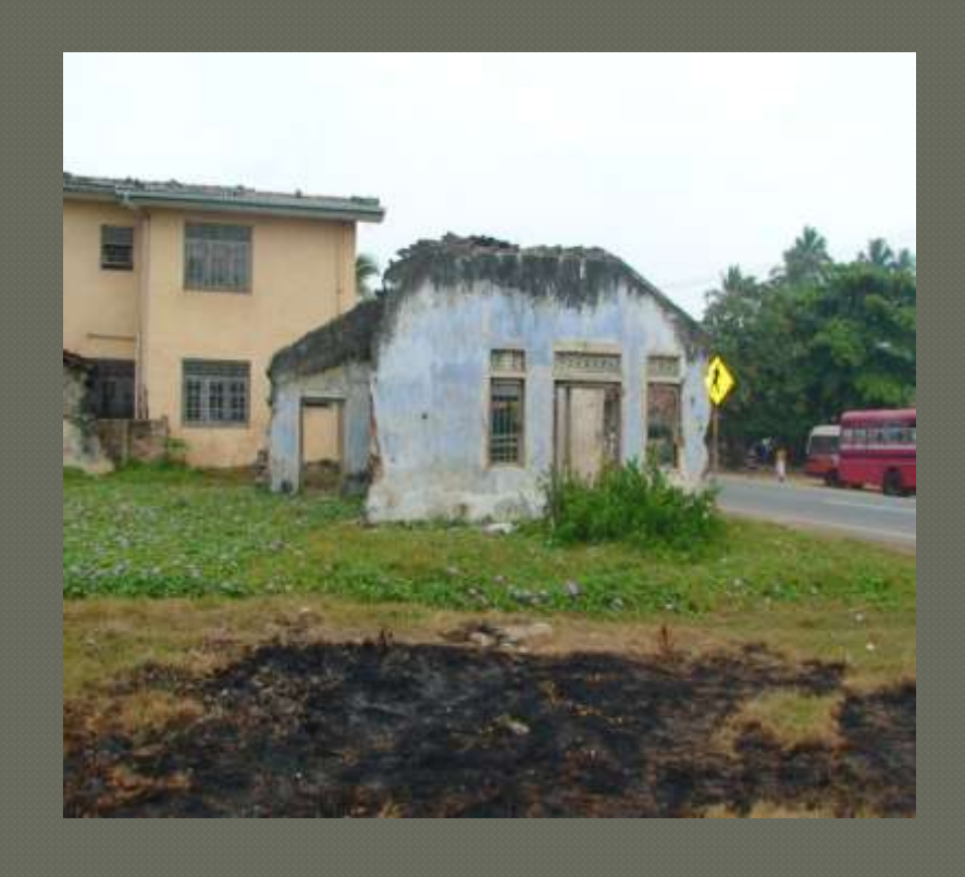
Tsunami hits the house