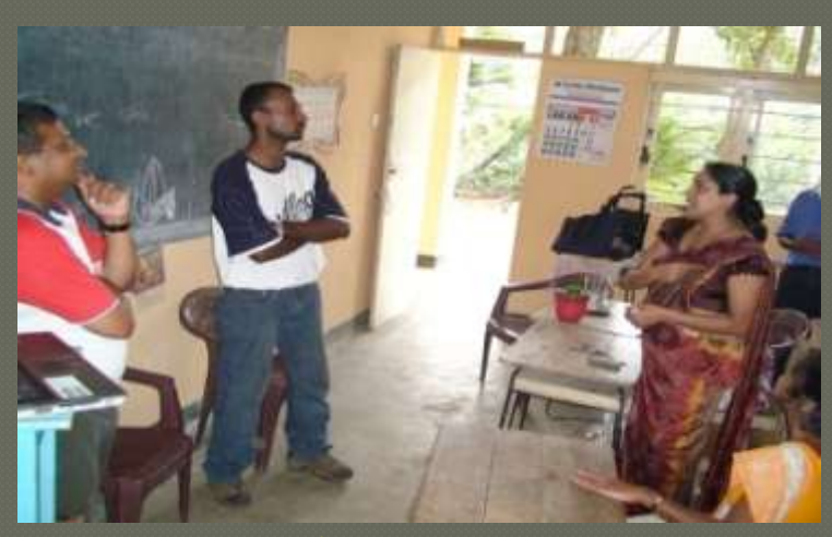
Principal feels to need change teaching methodologies