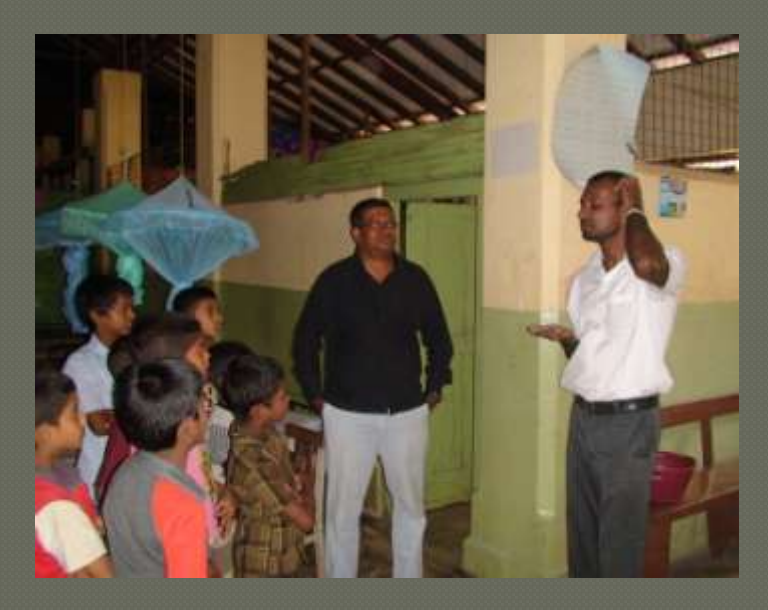
Awareness about Education